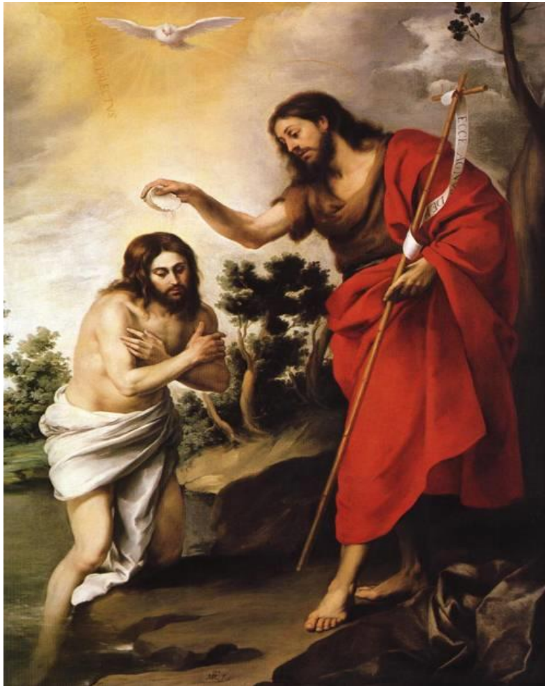
Bartolome Murillo. Baptism of the Lord, oil on canvas, 1655.

A Church Family in the Heart of the City