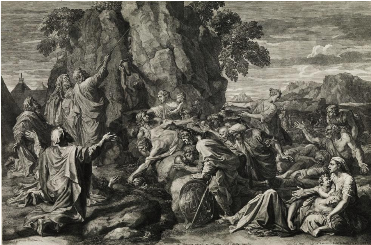
"Moses Striking the Rock" by Claude Stella after Nicolas Poussin. 1687

A Church Family in the Heart of the City