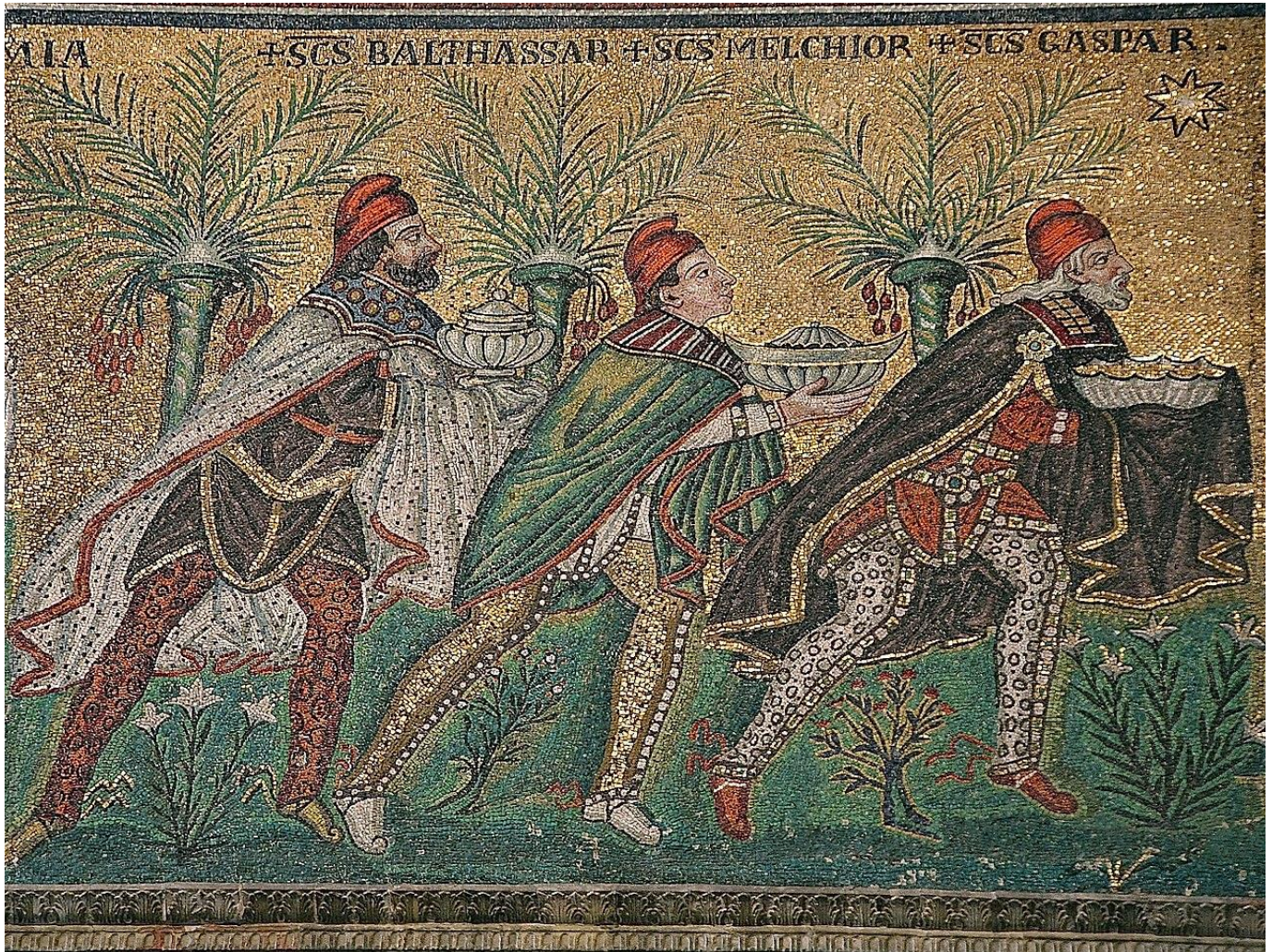
The Three Magi, Byzantine mosaic c. 565, Basilica of Sant'Apollinare Nuovo, Ravenna, Italy

A Church Family in the Heart of the City