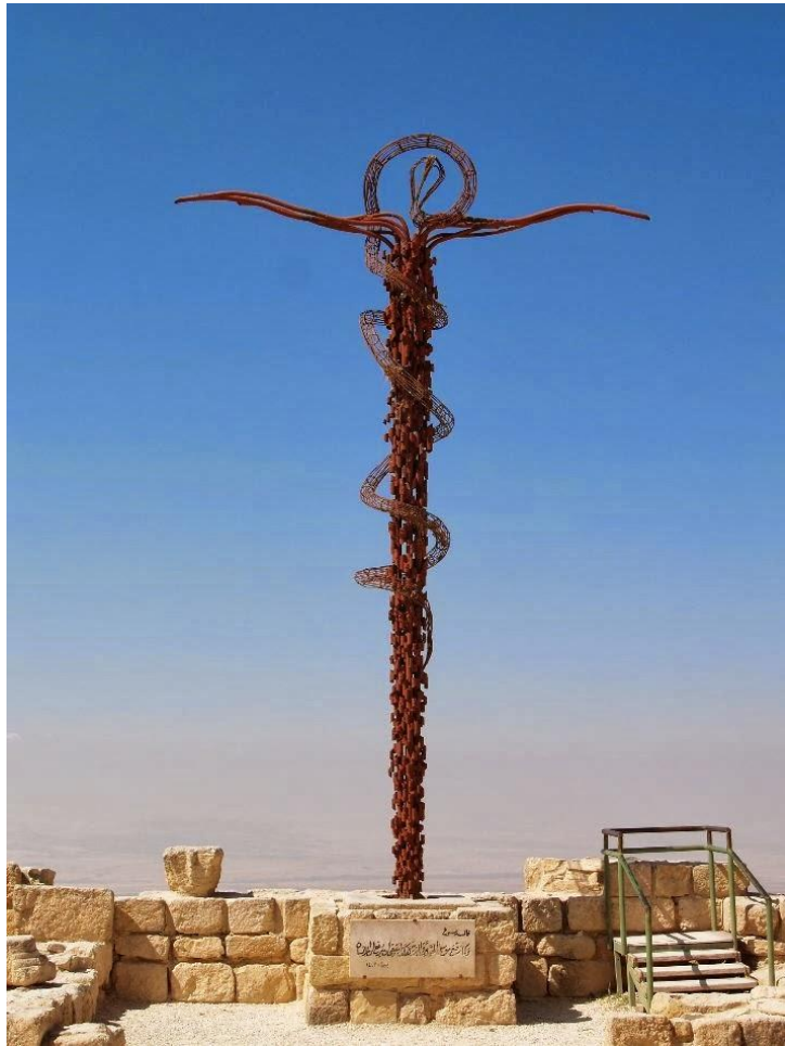
A modern sculpture of the bronze serpent erected on Mt. Nebo in front of the church of St. Moses.

A Church Family in the Heart of the City