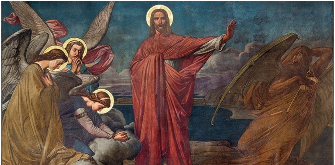
19th Century fresco of the Temptation of Jesus from St. George's church in Antwerp

A Church Family in the Heart of the City